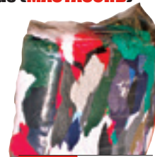
MS1010 10 lbs. MS1025 25 lbs.

A very large bag of rags vacuum-packed bags to ensure you get a large quantity of rags per bag. The rags are recycled clothing and are generally quite strong making them ideal for cleaning mastic.